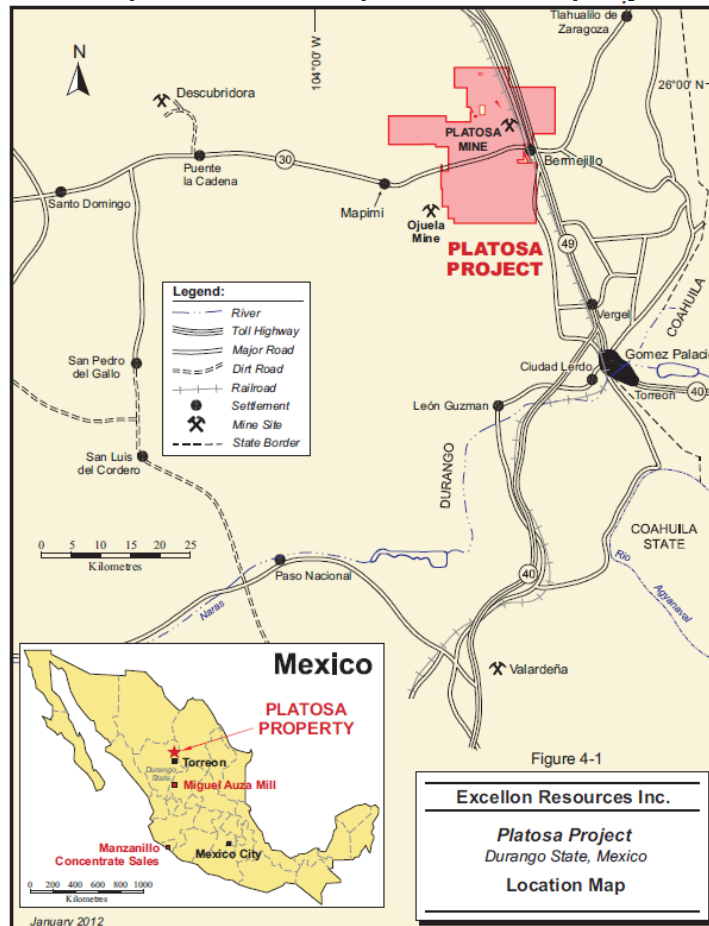
Map 1: Location Map – Platosa Property

Since the exploration press release dated November 15, 2012, five holes in addition to LP1032B, LP1034, LP1035 and LP1038 have been drilled at Rincon. LP1031, LP1033 and LP1037 encountered only minor sulphides while holes LP1032A and LP1036 were abandoned prior to reaching target depth because of technical problems.